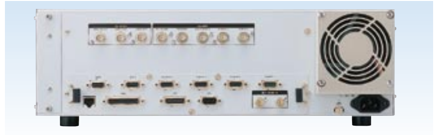
BVE-700 Processor Unit < Rear >