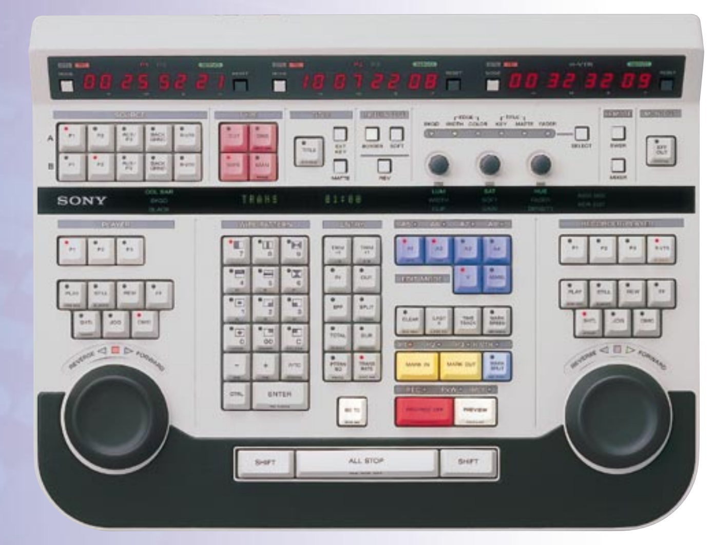
BVE-700 Control Panel

In addition to 1080i/24P, the switcher can also operate on 50 Hz and 59.94 Hz frequencies to accommodate the different demands in HD production.