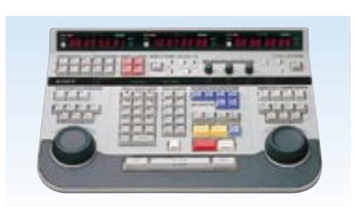
BVE-700 Control Panel