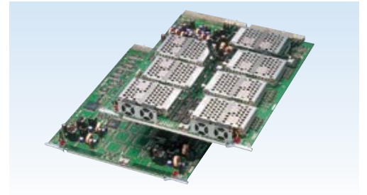
BKE-701 HD Switcher Board

© 2000 Sony Corporation. All rights reserved. Reproduction in whole or in part without written permission is prohibited. Features and specifications are subject to change without notice. All non-metric weights and measures are approximate. Sony and Betacam are trademarks of Sony.