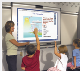
Interruption-free meetings and classes

* Walk-and-Talk board shown on Power and Data Track System over an Access™ Commercial Series Markerboard