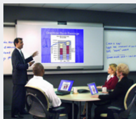
PolyKey™ Technology for instant plug-and-play