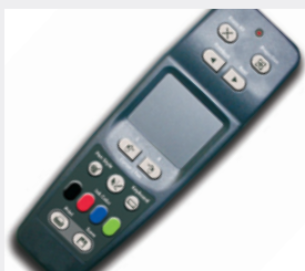
Intuitive remote control