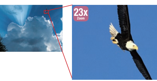
23x zoom lens, sufficient magnification for shooting, at Wide end (left) on to Tele end (right).

(35mm equivalent) and includes servo zoom, manual focus, and iris rings, along with a four-position (clear, 1/4, 1/16 and 1/64) ND filter. Other features include an optical image stabilizer and chromatic aberration correction.