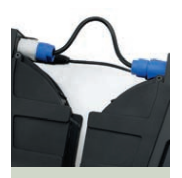
All in one system Each Stagebar unit has direct power and DMX inputs so there is no need for external power supplies or additional cables and DMX boxes.

A prime focus in the development of the Stagebar 54 has been to circumvent some of the logistic and setup problems associated with LED lighting. This has culminated in a simple, unique all-in-one solution.