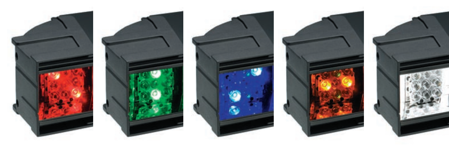
With the addition of Amber and White to the RGB mix Martin can offer a broader, finer range of colors

Working closely with the market, Martin has addressed many of the issues in terms of the functionality and serviceability of LED lighting. We have produced one of the most innovative, functional and service-friendly LED products on the market today.