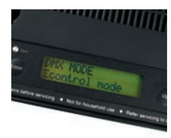
Look, no cables! A battery-powered control menu s an incredible time saver. This feature lets you configure and address the units off-site without being powered up.