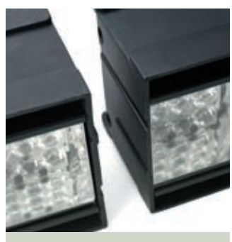
Straight lines of light Cutouts in end profiles make horizontal fixture alignment quick, easy and accurate.