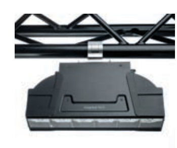
Light on the truss In addition, the Stagebar 54 is lightweight at 5.5 or 7.3 kg (12.1 or 16.1 lbs.), saving weight in transport and on the truss.