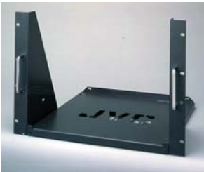
RK-C1700E ■ EIA Rack Mount Adapter

Design and specifications subject to change without notice.