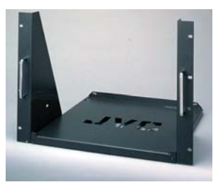
RK-C1700E ■ EIA Rack Mount Adapter